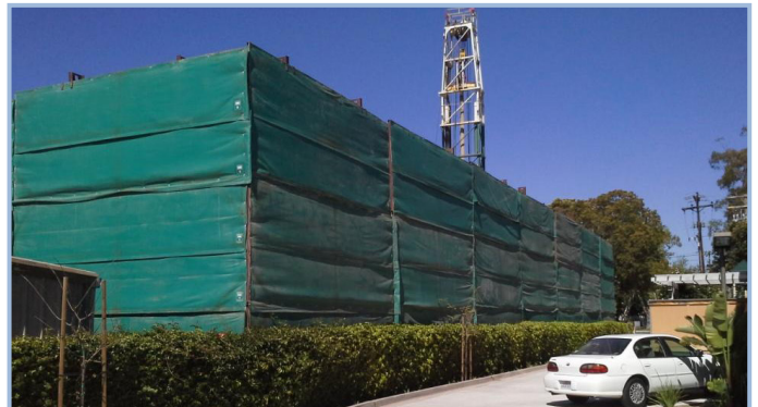
This is an example of the temporary sound wall that will be built around the John D. Morgan Park construction area to reduce noise.

* Project start dates and duration may vary due to site conditions and equipment availability.