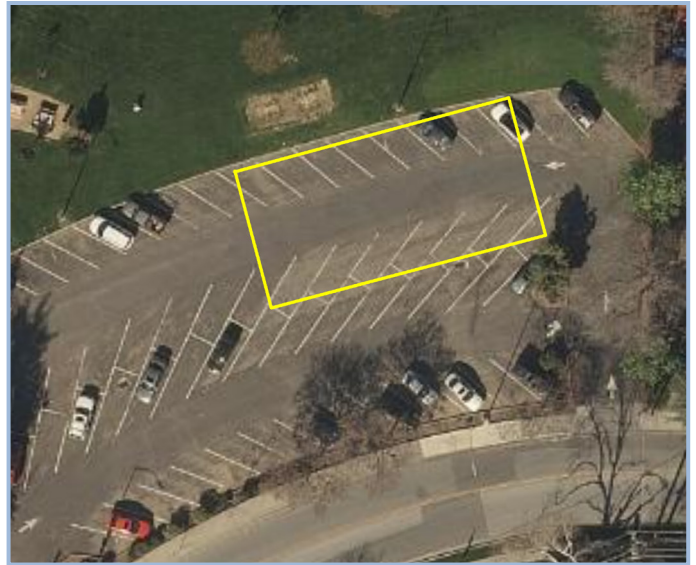
At John D. Morgan Park, the project site (yellow box) is located at the south parking lot at the Budd Avenue entrance.

After the construction project is complete, the wells will be enclosed in a utility box level with the ground and will not impact park visitors.