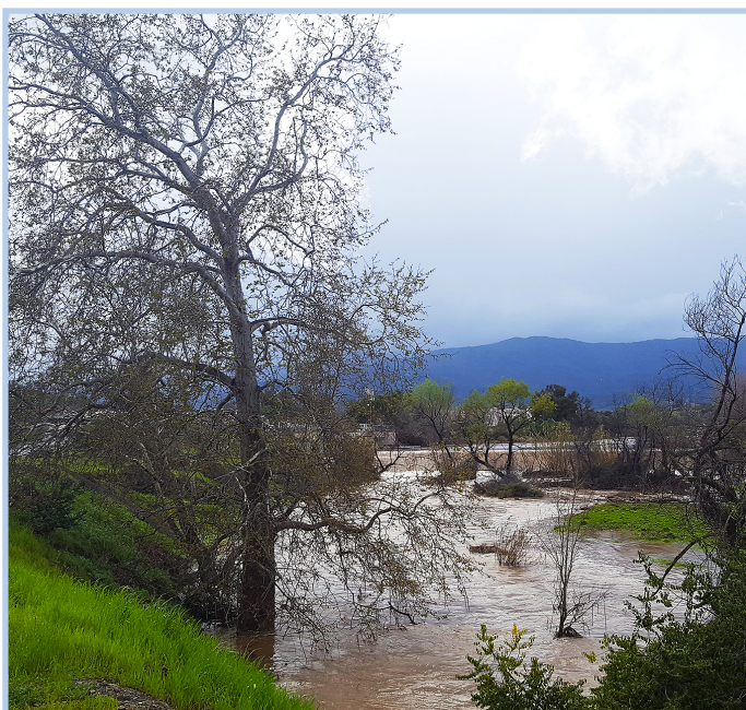
Guadalupe River between Blossom Hill Rd. and Almaden Lake Park, San Jose.