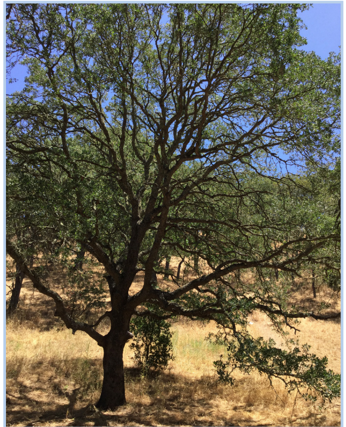
Blue oak ( Quercus douglasii ) near Smith Creek, Los Gatos