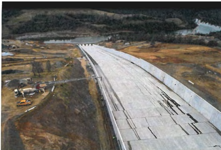
A view of the recently completed Lake Oroville main spillway. Backfill operations continue to raise the area around the underdrain piping system outside the sidewalls of the spillway.

SACRAMENTO, Calif. – The Department of Water Resources (DWR) today received notification that the Federal Emergency Management Agency (FEMA) has approved $205 million in federal funds to reimburse the state for spillway reconstruction costs related to the 2017 Oroville Dam spillways incident. These funds are in addition to $128.4 million FEMA previously approved for reimbursement for emergency response, debris removal, and other costs.