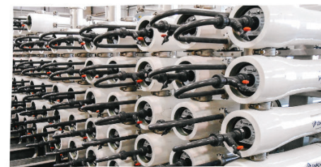
#2 REVERSE OSMOSIS