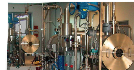
#2 OZONE DISINFECTION