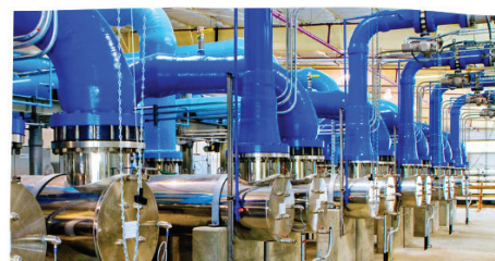
#3 UV LIGHT DISINFECTION AND ADVANCED OXIDATION