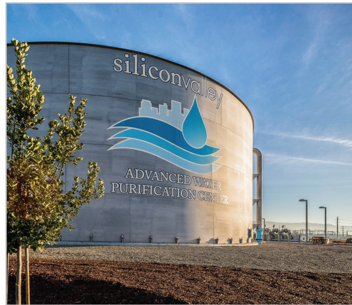
Silicon Valley Advanced Water Purification Plant.

When completed, this project will build a facility capable of providing at least 10 million gallons per day of high-quality, drought-resilient water.