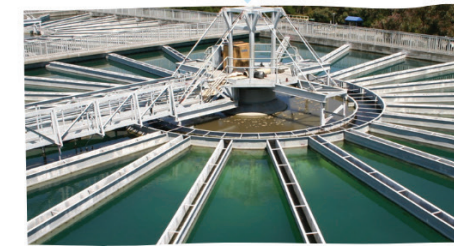
#1 REMOVE SOLIDS

Water from local reservoirs or imported water sources like the Central Valley and Sierra Nevada Mountains.