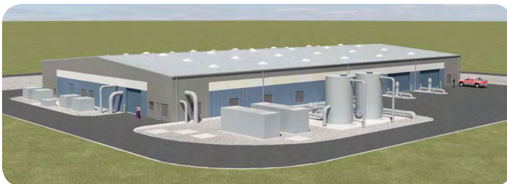
The Silicon Valley Advanced Water Purification Center

Our water purification facility will allow us to demonstrate the reliability of the treatment process here in Santa Clara Valley.