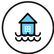
Reduced flood flows