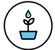
Irrigation and industrial