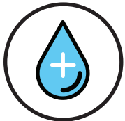
Emergency water reserve

Provides Santa Clara, San Benito, Santa Cruz and Monterey counties